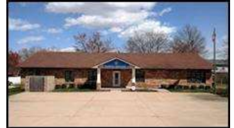
Masonic Lodge, Glen Carbon IL

Newsletter of the Metro East Unitarian Universalist Congregation