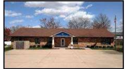
Masonic Lodge, Glen Carbon IL

Newsletter of the Metro East Unitarian Universalist Congregation