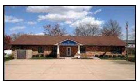
Masonic Lodge, Glen Carbon IL

Newsletter of the Metro East Unitarian Universalist Congregation