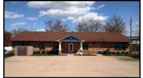
Masonic Lodge, Glen Carbon IL

Newsletter of the Metro East Unitarian Universalist Congregation