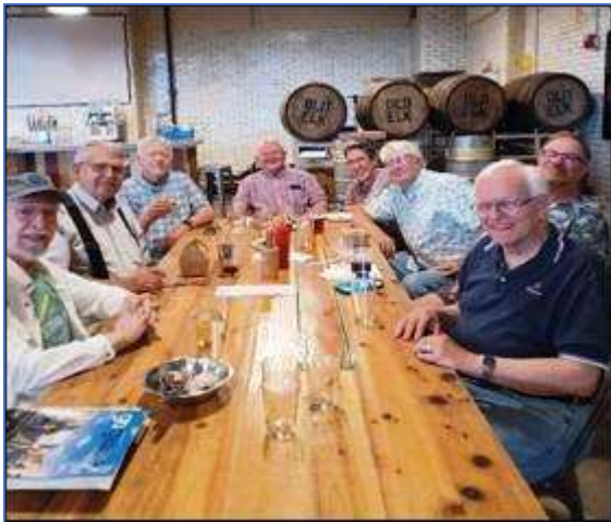
Men's Lunch Group (taken on 7-11-24)

Next Meeting is on Thursday, August 8 @ 11:30 a.m.