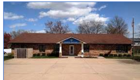
Masonic Lodge, Glen Carbon IL

Newsletter of the Metro East Unitarian Universalist Congregation