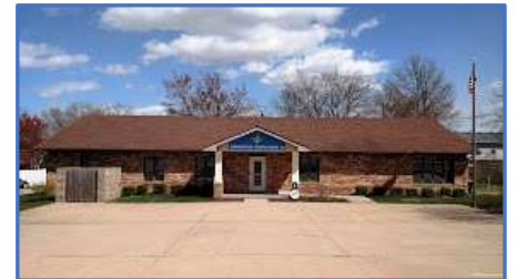
Masonic Lodge, Glen Carbon IL

Newsletter of the Metro East Unitarian Universalist Congregation